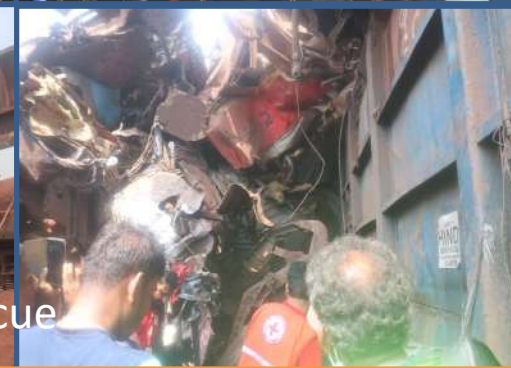
Red Cross Involve in Search & Rescue

On the 2 nd June, 2023 three trains collided at Bahanaga Bazar Station, Balasore District. Near about 300 people died & thousand injured. Red Cross provided emergency services with mobilizing counsellors and volunteers & provided emergency services like First-aid, crowd management, dead body management, carrying the injured to hospital etc. For providing Blood to the accident victims, YRC/JRC arranged blood donation Camp & donated blood for providing blood to the train accident victims.