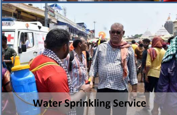
Water Sprinkling Service