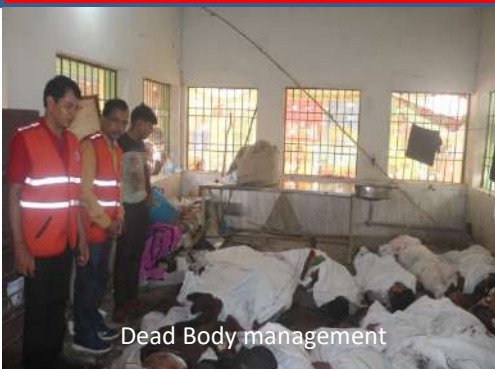
Dead Body management