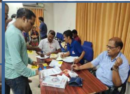
35 units collected from Blood Donation Camp at ITI College, Bhubaneswar