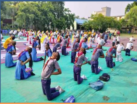
Nabarangpur College, Nabarangpur Yoga