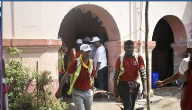
Stretcher Service and Emergency First Aid provided to the Sick & Wounded person by JRC & YRC Volunteers