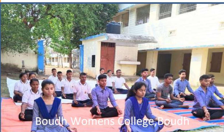
Boudh Womens College, Boudh