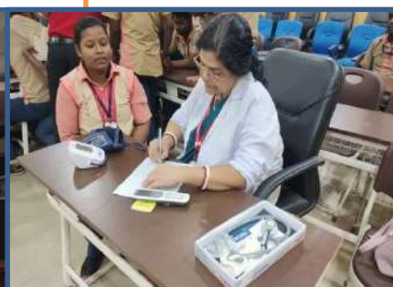
33 units collected from Blood Donation Camp at ITI College, Bhubaneswar