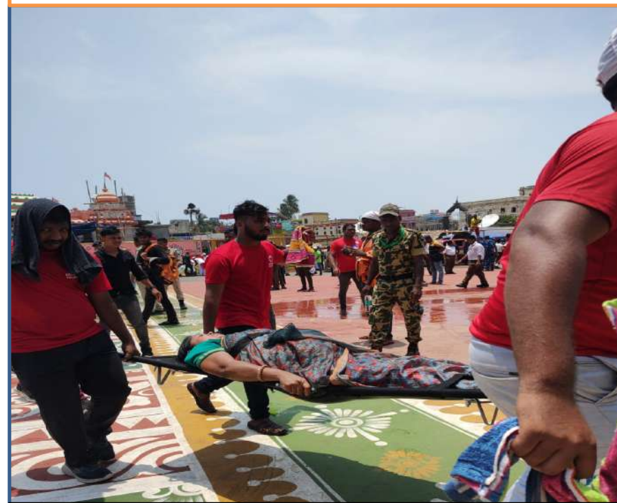
A women devotee fainted due to suffocation and dehydration; Red Cross volunteers are responded immediately and transported to the medical by ambulance.

Special arrangements were made in view of the prevailing hot and humid conditions in Puri. Drinking water, Lemon Water and ORS water were distributed to the devotees to combat heat, Red Cross engaged more than 450 volunteers in rendering first aid services at the 29 first aid centers opened by Govt. .All volunteers were divided into groups which were led by Lay Lecturers in first aid and SERV Trainers. More volunteers were engaged at two major points like Utkal Hindi Vidyapitha and District Head quarter Hospital for providing first aid services and stretcher services. Red Cross provided stretcher Service, First Aid Service, Ambulance Service, Green Corridor Service. Red Cross held cleanliness drive at Badadanda just after the pulling of three Chariots by the devotees for a healthy atmosphere and for a Swatchha Rath Yatra. Apart from the above services at Puri , YRC and JRC wing in association with DRCB at different districts like Mayurbhanj, Kendrapara, Koraput, Dhenkanal, Keonjhar etc also hold social service camp on the eve of Car festival.