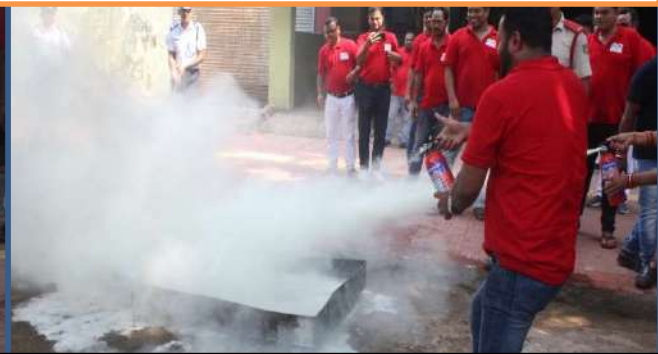
Training on dealing with Fire Accident & Mishap