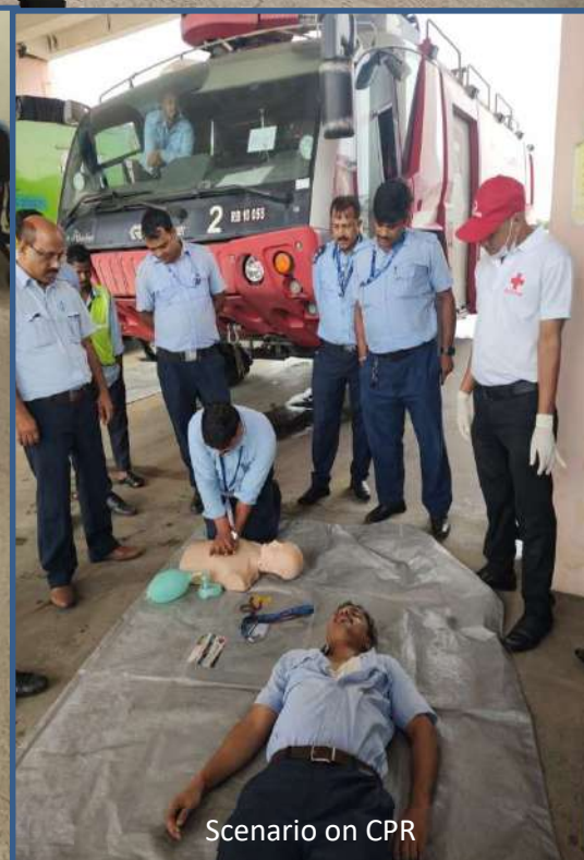
Scenario on CPR