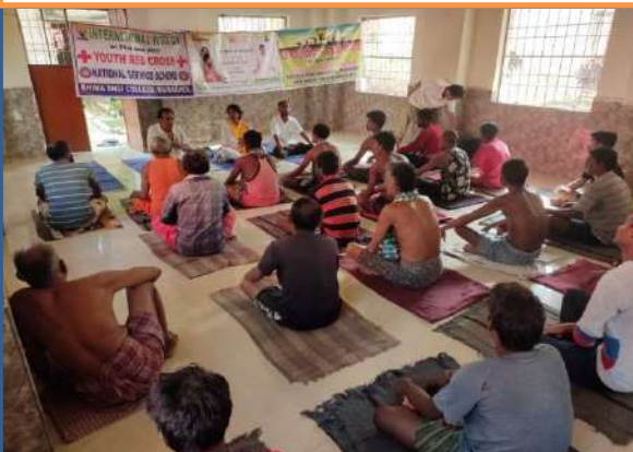
Bhim Bhoi College, Rairakhol, Sambalpur