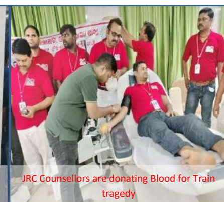
JRC Counsellors are donating Blood for Train tragedy