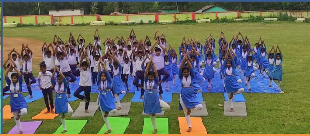
Government High School, Kumuli, Koraput