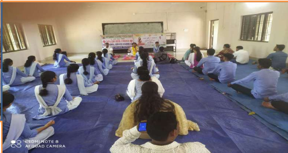
Bhimabhoi College, Rairakhol, Sambalpur Yoga