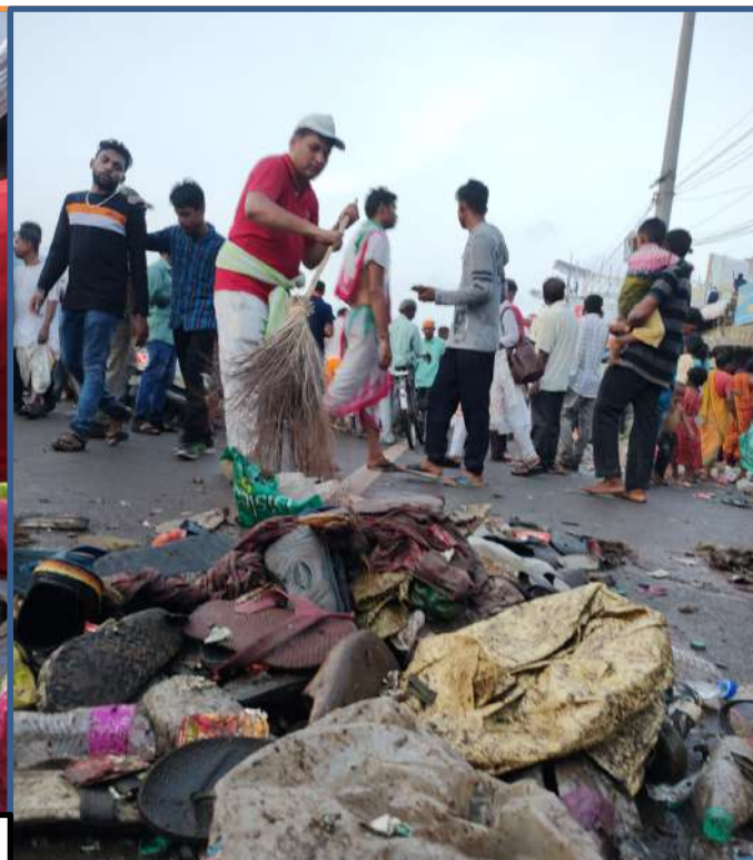
Removing garbage's & debris from the Badadanda