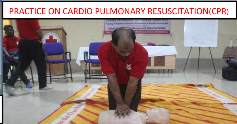
PRACTICE ON CARDIO PULMONARY RESUSCITATION(CPR)