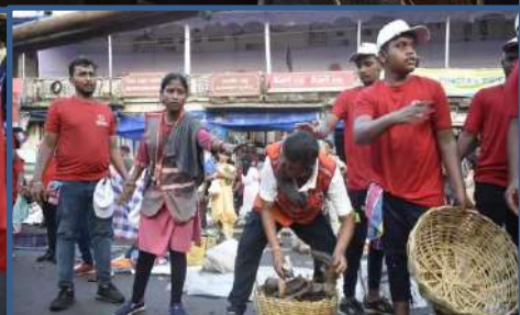
Badadanda Cleaning by Red Cross Volunteers