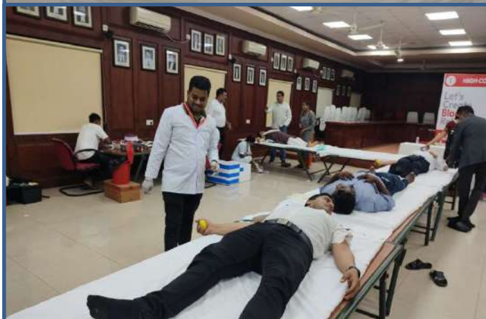
Blood Donation Camp at Odisha High Court , Cuttack. Total 146 units has been collected