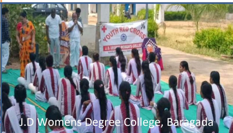
J.D Womens Degree College, Baragada