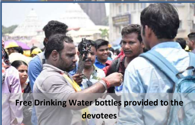
Free Drinking Water bottles provided to the devotees