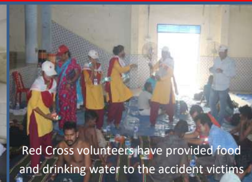
Red Cross volunteers have provided food and drinking water to the accident victims