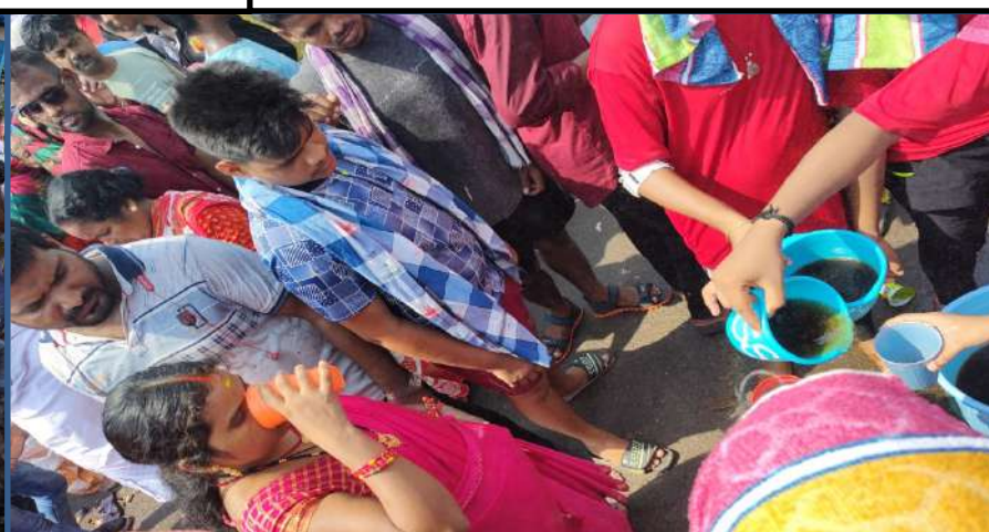
Red Cross volunteers provided Cold Cola Drinks to the devotees to avoid dehydration