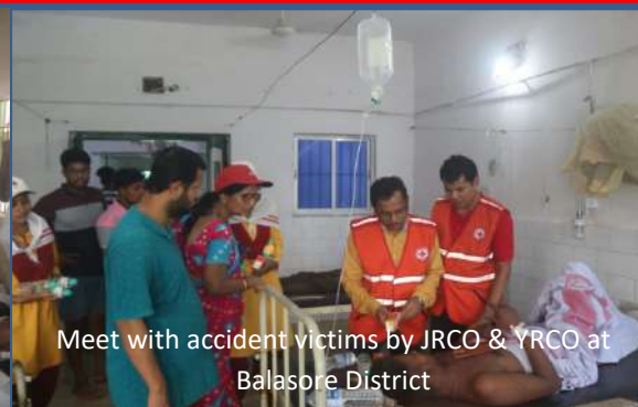
Meet with accident victims by JRCS & YRCS at Balasore District