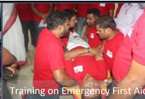
Training on Emergency First Aid