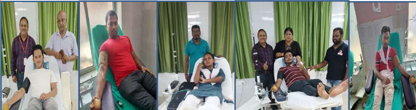
Red Cross Volunteers donated Blood for the accident victims at Red Cross Regional Blood Centre, IRCS-Odisha State Branch

On the 2 nd June, 2023 three trains collided at Bahanaga Bazar Station, Balasore District. Near about 300 people died & thousand injured. Red Cross provided emergency services with mobilizing counsellors and volunteers & provided emergency services like First-aid, crowd management, dead body management, carrying the injured to hospital etc. For providing Blood to the accident victims, YRC/JRC arranged blood donation Camp & donated blood for providing blood to the train accident victims.