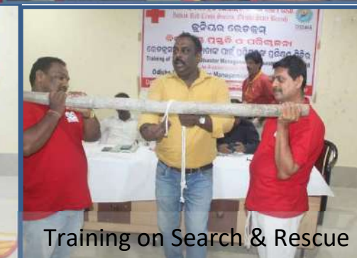
Training on Search & Rescue