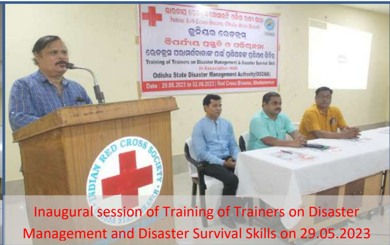
Inaugural session of Training of Trainers on Disaster Management and Disaster Survival Skills on 29.05.2023