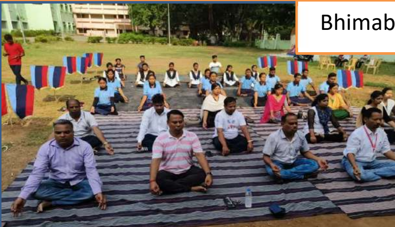
Bhimabhoi College, Rairakhol, Sambalpur