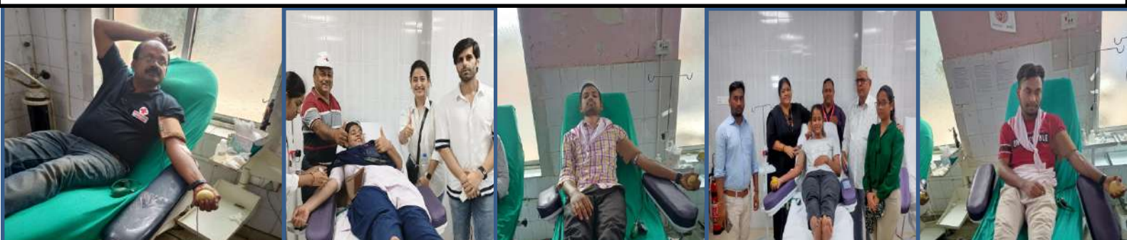
Red Cross Volunteers donated Blood for the accident victims at Central Red Cross Blood Centre, Cuttack