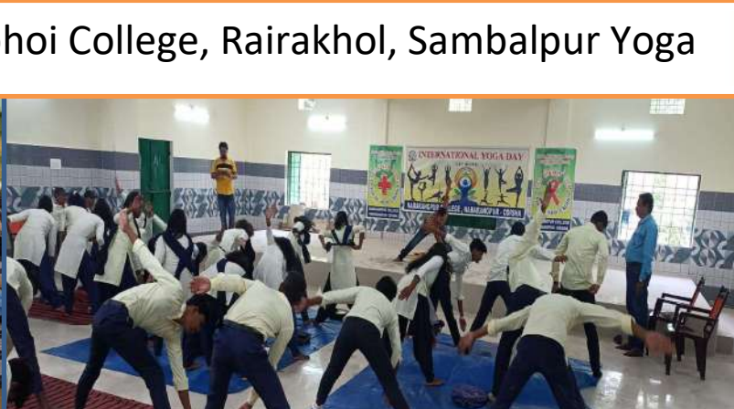
Nabarangpur College, Nabarangpur